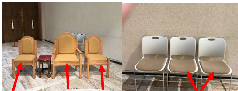
Book Bearer Celebrant Cross

Book bearer bows at the bottom of the stairs then goes to stand behind the chair to the right of the celebrant. Cross bearer stands behind the chair to the left of the celebrant. Candles sit in the altar server chairs against the wall.